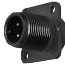
Box Receptacle Pin CXX 3102A XXXX XX P XXX